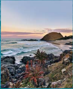
COVER PICTURE Coffee Bay, Wild Coast